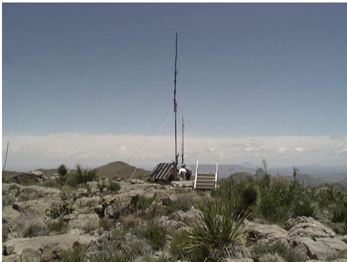
146.82 Christmas Mountain Repeater (covers Big Bend National Park and surrounding area)

There was general agreement at the beginning meetings of the Big Bend Amateur Radio Club in 1974 that the purpose of the club would be to serve as a general club to serve the needs of amateurs and the communities in the Big Bend area. Our dues money would go primarily to establish a single 2-meter repeater to serve the Alpine area. That was going to be expensive – more money than any one of us could afford to finance on our own. So we set the dues at $3 per month, payable yearly, totaling $36.